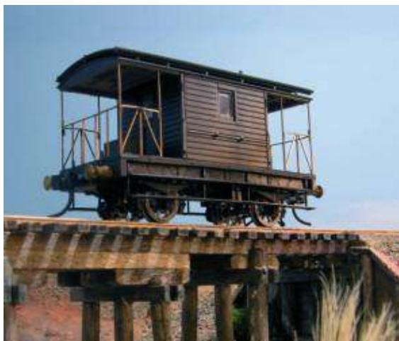
The CHG pilot model.

As the accompanying photographs show, this project is nearing completion and the factory is telling us that this project is likely to be the first project delivered in 2008. In fact, we may even see them in January, 2008 before Chinese New Year. As previously announced ten packs of LCHs and CCHs and a mixed pack of five LCHs and five CCHs will be available. At least five sets of numbers will be available for a total of 50 different numbered vehicles.