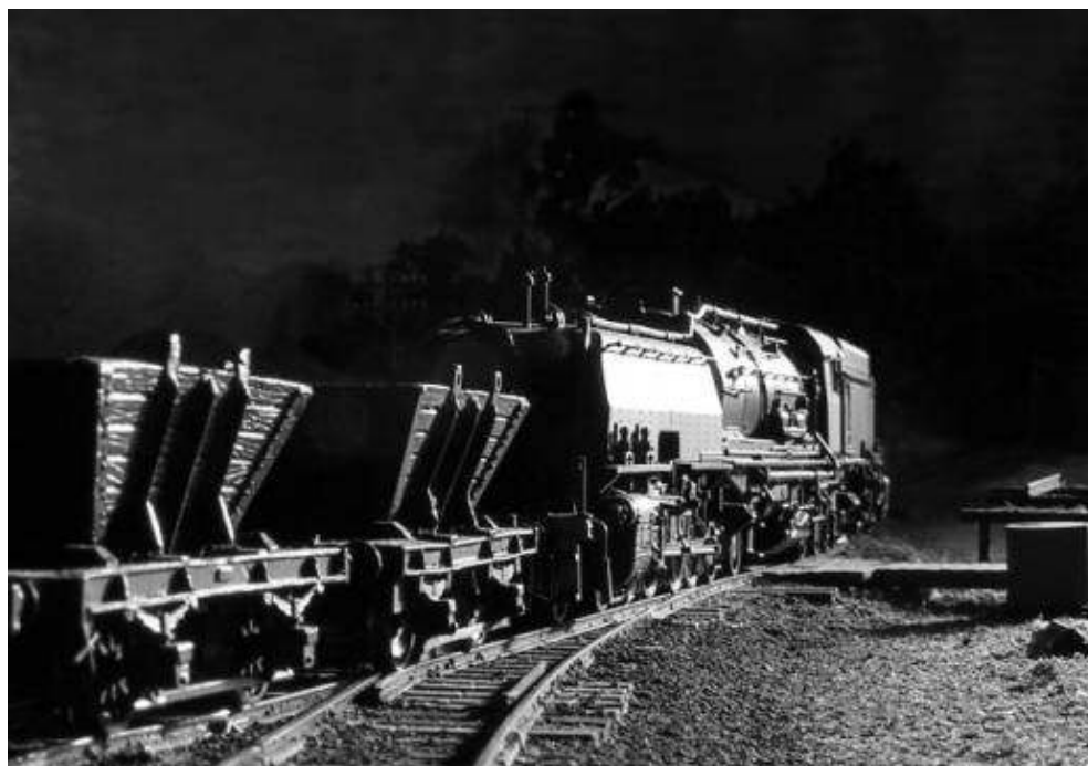
An unidentified garratt passes during the night at the head of a rake of 4 wheel coal hoppers.

That should be enough to keep us busy, so let's get on with it.