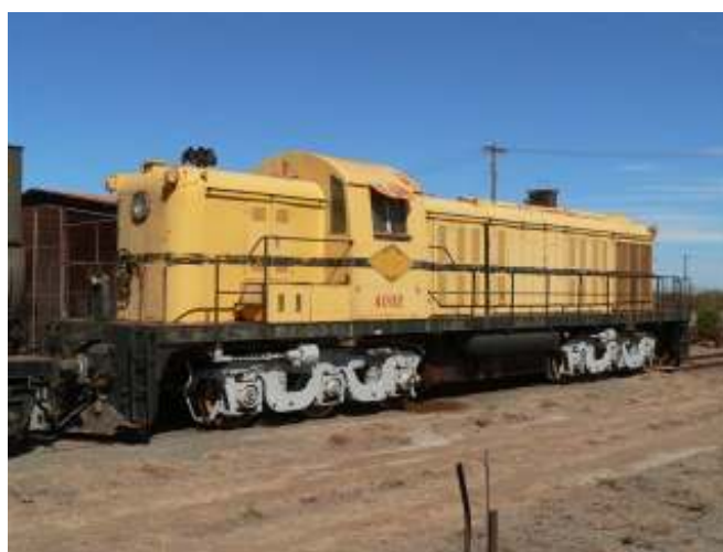
4002 with middle axle in place. Compare this with the photo in The Eureka Times 13.

The drawings for the 40 class have been approved and tooling has commenced. Those who have the task of checking drawings for a project say that these are the best set of drawings that we have received on any project so far. Progress to date on this project is such that we are confident of a delivery date sometime in the second half of 2008. The model will be available with QSI sound.